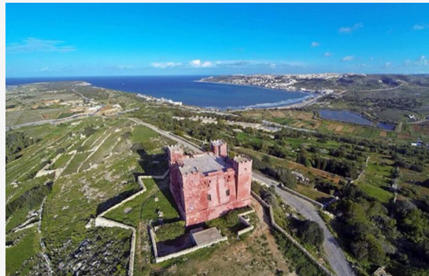
Figure 1.2. Red Tower