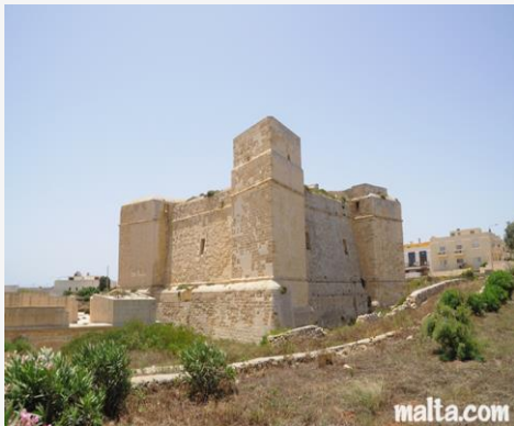
Figure 1.1. St. Thomas Tower