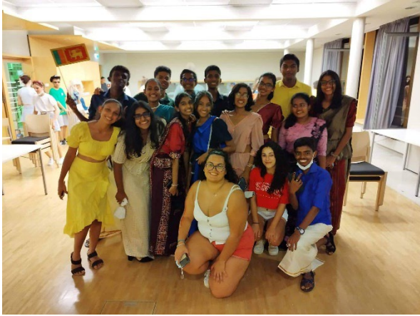
Sri Lanka's presentation

Another great fun activity were the parties that were planned every Saturday, each one with a specific theme. It was a fun way to get to know other people, while also sharing a laugh at all the original and fun costumes. Meanwhile, the culture evening was also a night to remember: we learned about different cultures and even baked or tried some traditional food from each country.