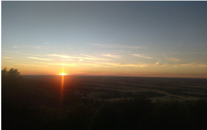
A walk at sunset on a lazy Sunday

On Wednesdays and on Saturdays we would all look forward to the various excursions that they had planned for us. Some of the places we visited were Heidelberg, Nürnberg, and Heilbronn; where we visited one of Germany's universities and even a science centre, and Schwäbisch hall. In each city, we got to enjoy a tour where we learnt about the city's history. One of the most magical places we visited was a castle in Heidelberg. It was truly an experience of a lifetime, where we not only improved our German but also got to discover the beauty that Germany has to offer.